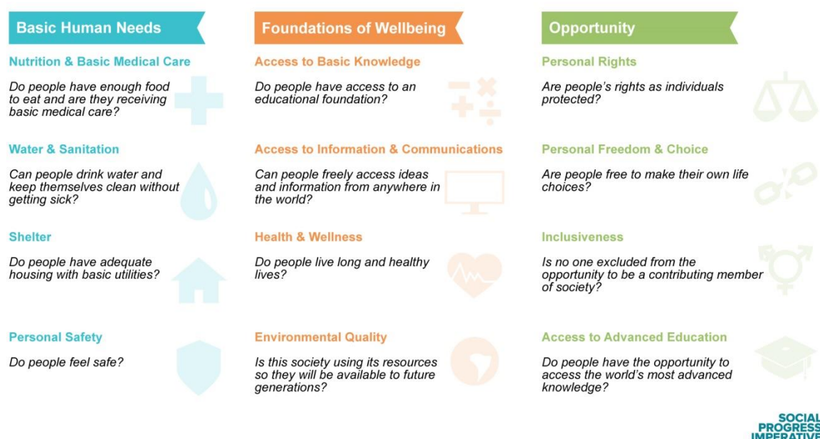
Figure 2: Social Progress Index Guiding Questions